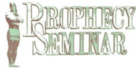
EXHIBIT 2 For Daniel Lesson 19

NOTE: God does not tell us the reason why He prohibited His ancient people from eating these foods. However, modern medical science has helped us to understand some of the reasons why God saw that these foods were not fit for human consumption. The purpose of these animals on the earth was not to be a part of the food chain for people, but to be garbage collectors. The pig was to be the garbage collector of the earth, while shellfish were the garbage collectors of the ocean. Pork is one of the worst carriers of the trichina worm, and causes trichinosis. Likewise, pork is very high in cholesterol. Most fish do not contain much cholesterol; however, shellfish contain as much cholesterol as pork sausage. No wonder God said to leave it alone. That's one of the reasons a physician removes pork from a heart patient's diet as soon as it is discovered that there is any kind of heart problem. How much better it would be to not have our arteries clogged in the beginning! That's why God said not to eat these foods. (For further information on medical research on