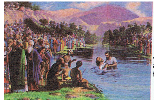
Jesus calls all nations to Him.