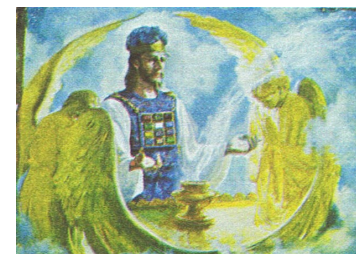
Jesus began the last phase of His heavenly ministry in the Most Holy Place