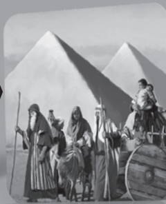
THE EXODUS FROM EGYPT