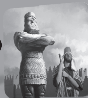
THE CAPTIVITY IN BABYLON

The Bible is one continued story of the history of God's love for humankind. The various names we give it are an indication of that fact: The Plan of Salvation , The Great Controversy Between Christ and Satan , Eden Lost to Eden Regained , to name a few. Like any well-written story, the Bible contains both major and minor events. Certain Bible stories tell of major turning points in human history. These are events that change life forever. Six of these stories have been pictured for you as pillars to make a framework on which to hang all the events of the Bible: Creation, the Flood, the Exodus (from Egypt), the Captivity (in Babylon), Jesus' first coming, and Jesus' second coming.