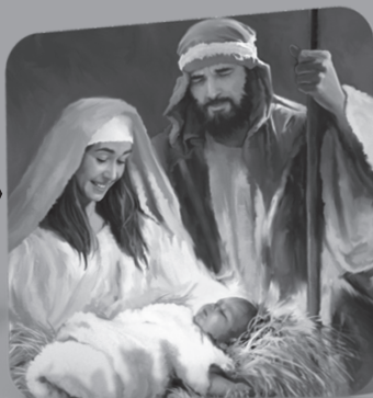
THE FIRST COMING OF JESUS