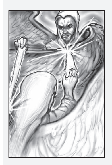
This fight between Gabriel and the evil angels happened because God wasn't using all His power to stop it.

Think of a time when you worked with a difficult person, whose heart was filled with anger or hate. Maybe this person was mean and nasty to you. But you showed them love. What did this experience teach you about the limits of power and what you can and can't do as a Christian?