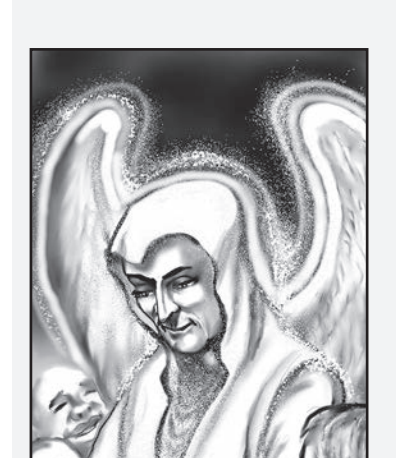
"2 Corinthians 11:14 says we shouldn't be surprised that 'the devil makes himself look like [the same as] an angel of light' [NLV]."

ADDITIONAL THOUGHT: Read Ellen G. White, "The Power of Satan," pages 341–347, in Testimonies for the Church , volume 1.