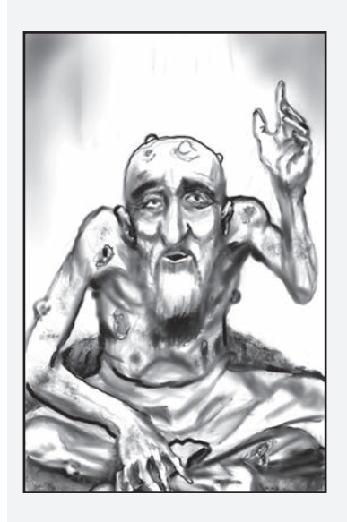
When Job blesses God, he shows that Satan's words against God are lies.

We learn many things from this story. We learn that there are rules for fighting in the worldwide war between God and Satan. There are limits, too, to what Satan can do. God also has limits. His love limits what He may do to show that He is innocent and to show that Satan is guilty.