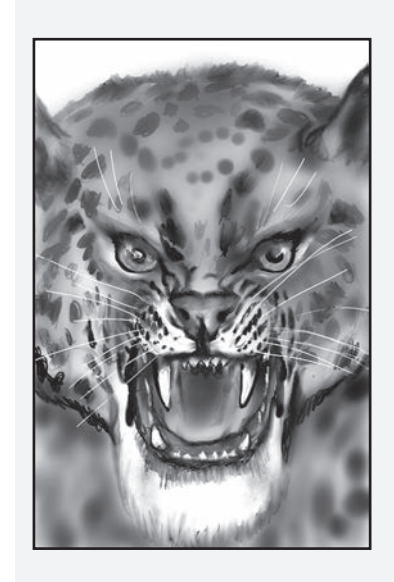
The wild animal from the sea "was given a mouth which spoke words full of pride and it spoke very bad things against the Lord."

Satan "knows his time is short" (Revelation 12:12, NIrV). The happenings in the book of Revelation show certain limits to Satan's power (read Revelation 12:14; Revelation 13:5). In the end, God wins. Then "God will wipe every tear from their eyes. No one will die. No one will ever [anymore] cry or be sad for any reason. No one will ever have trouble. The old things are gone" (Revelation 21:4, WE).