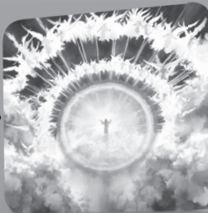
THE SECOND COMING OF JESUS