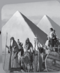
THE EXODUS FROM EGYPT