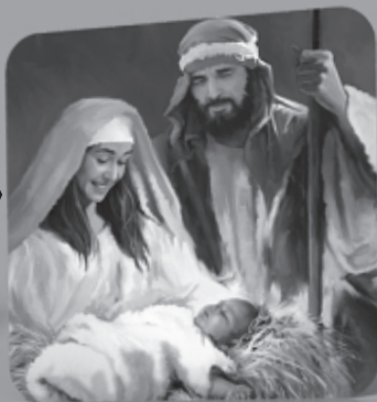
THE FIRST COMING OF JESUS