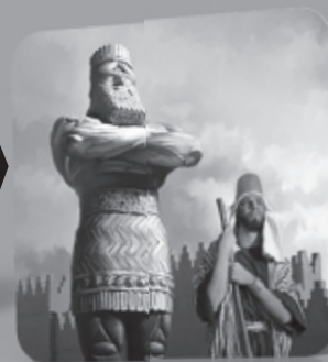
THE CAPTIVITY IN BABYLON

The Bible is one continued story of the history of God's love for humankind. The various names we give it are an indication of that fact: The Plan of Salvation , The Great Controversy Between Christ and Satan , Eden Lost to Eden Regained , to name a few. Like any well-written story, the Bible contains both major and minor events. Certain Bible stories tell of major turning points in human history. These are events that change life forever. Six of these stories have been pictured for you as pillars to make a framework on which to hang all the events of the Bible: Creation, the Flood, the Exodus (from Egypt), the Captivity (in Babylon), Jesus' first coming, and Jesus' second coming.