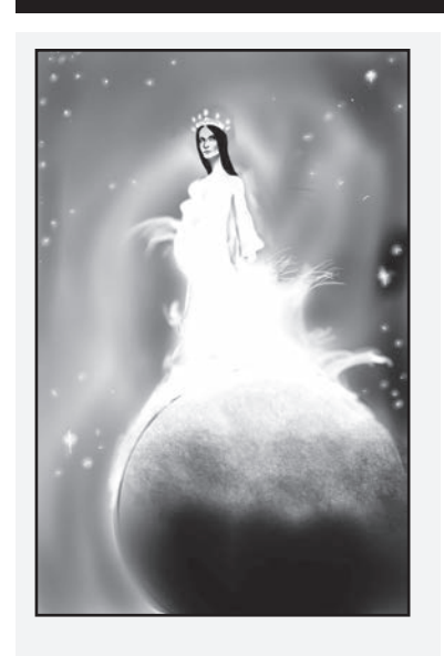
In the Bible's special messages about the future, a woman is a powerful symbol for God's church.

READ FOR THIS WEEK'S LESSON: Ruth 1:1–5; Ruth 2:5–20; Ruth 4:1–12; Job 1:6–11; Esther 3:1–14; Esther 4:13, 14.