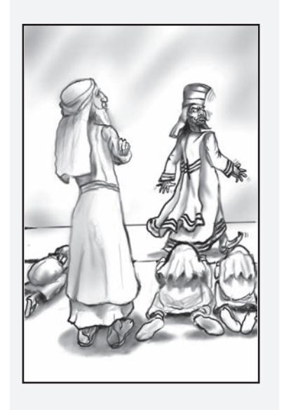
Haman notices that Mordecai won't bow down and worship him.

Think about the "small" things that test your faith now. If you fail these small tests, how will you do when the big test (the Sabbath) comes?