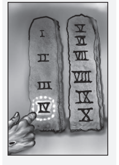
"The Lord will show that the Sabbath is Bible truth."

"Satan will cause people to get angry with the small group of people who refuses to accept popular teachings and beliefs. Powerful, famous people will join with the most terrible sinners and lawbreakers. They will decide how to punish God's people. These powerful and famous people will use their money, knowledge, and education to destroy the good name of God's people. Leaders, pastors, and church members will work together to hurt them. The powerful and famous will say awful things about God's people. These evil people will make fun of God's people and try to destroy their faith. The evil people will lie about God's people. Their lies will make everyone very angry at God's people. The evil people don't have any proof from the Bible to show that God's people are wrong for honoring the Sabbath. So, the evil people will make laws to punish God's loyal people. Government leaders will make Sunday laws legal because they want the people to vote for them. But God's people honor Him. They can't accept a man-made law that breaks God's Ten Commandments. The final fight in the worldwide war between God and Satan will be about the Sabbath. God makes sure that everyone on earth understands what the final fight is all about. Today, as in the days of Esther and Mordecai, the Lord will save His people. The Lord will show that the Sabbath is Bible truth."—Ellen G. White, Prophets and Kings, pages 605, 606, adapted.