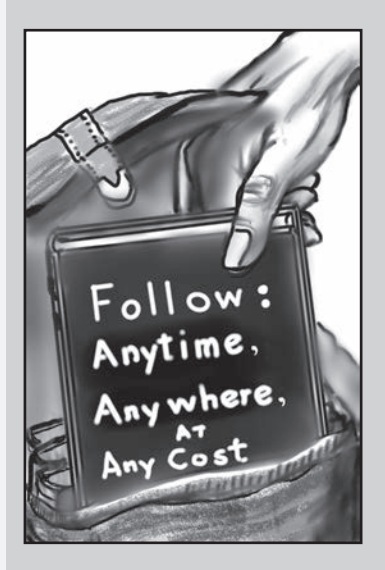
Diana reached into her backpack and pulled out the same book.