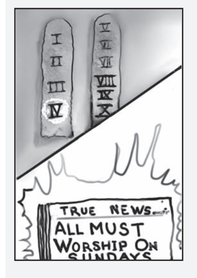
The book of Revelation tells us plainly what will happen: we will worship God or worship the beast and his false god.

Death because of man-made laws against healing on the Sabbath? (Nothing in the Bible says healing on the Sabbath breaks God's law. In the same way, nothing in the Bible teaches that Sunday replaced the Sabbath.) Of course, the problem about the Sabbath in these verses isn't the same as in the end times. But these verses help us understand that the test in the end times will be a choice between manmade laws and God's law. In both the story in John 5 and in Revelation 13, the test will be about the Sabbath.