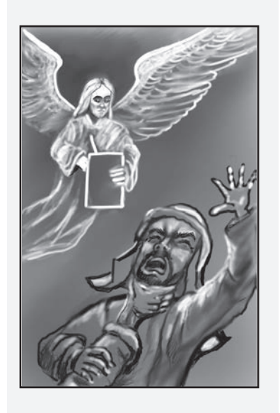
"Angels went to Sodom. There, they made a record of the things the people of the city did."

Think about Daniel 2 and 7. All the kingdoms came and went just as the Bible said. Today, when we look back at history, we can see that only one more kingdom is to come. Which kingdom is that? Why can we trust that it will happen just as God says?