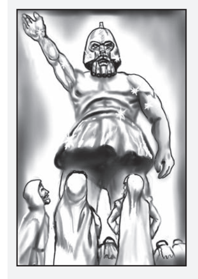
The king's command helps us understand that the wish to do things our way can blind us to God's truth about how the worldwide war between good and evil will end.

Think how easily these three men could have made excuses for bowing down. But they were willing to be burned alive instead. Does that mean they were a little crazy? Couldn't they have just faked their worship? They could bow down, pretend to tie their shoelaces, and pray to their own God in their hearts, right? Did they really need to risk their lives? They thought so, even if their words show that they knew they may not escape with their lives.