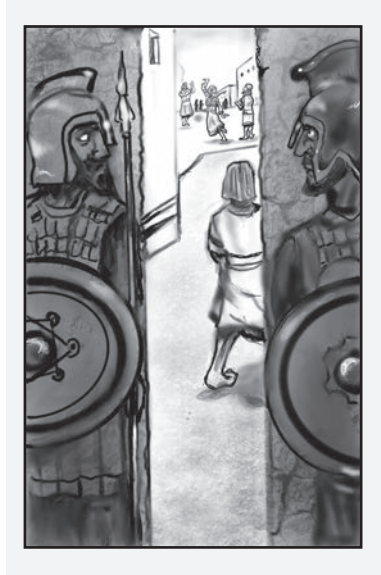
The people on this earth will be surprised at the Second Coming. Why? Because they chose not to believe the things that God said would happen.