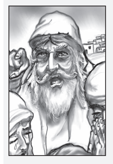
The whole city confesses their sins. So, God doesn't destroy Nineveh, at least not at that time.

What choices are you making now that can help you make the best choice during the final test that is coming?