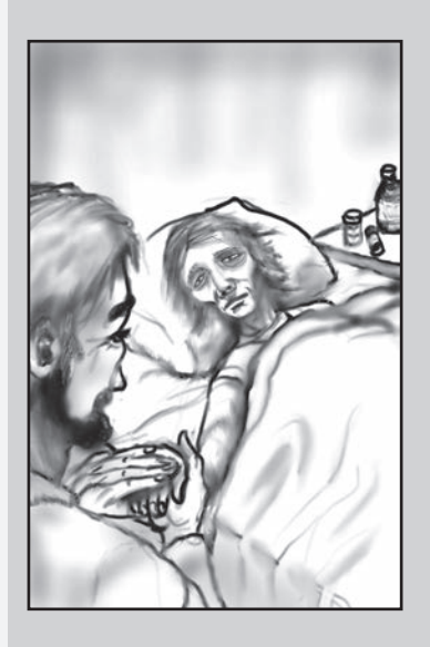
"Let's go to the Adventist church. You've tried so many pills and other things. But nothing helps."