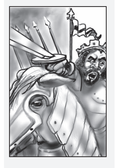
So much of the sad history of humans is stories about the terrible things that their leaders did.

READ FOR THIS WEEK'S LESSON: Genesis 10:1–12; Genesis 12:1–9; 1 Samuel 8:4–18; Matthew 20:25–28; Isaiah 42:6.