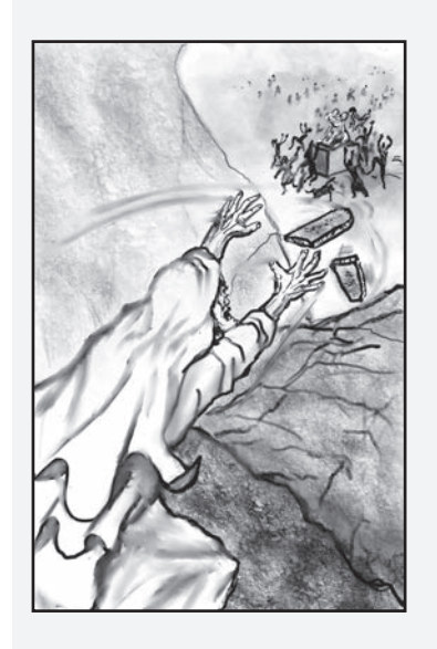
God gave Israel wonderful Bible truths. But Israel didn't live these truths or obey them.

We must obey Bible truth, and not just believe it. Why is this rule important for us today, as Adventists?