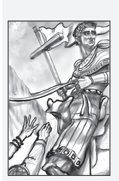
"Many people were happy when Constantine became a Christian. Many non-Christian people joined the church at that time."

ADDITIONAL THOUGHT: Sin is a mystery. "More and more, this mystery did its evil work in the Christian church. At first, this mystery worked in a sneaky way to get control of men's minds. Then, as this mystery grew stronger, it no longer tried to hide what it was doing. False beliefs came into the church. The attacks on Christians kept the evil out of the church for a time. But then the attacks stopped. Kings joined the church. The church stopped being the same as Jesus in her heart and became filled with pride. The church replaced the laws of God with man-made rules and ideas. Many people were happy when Constantine became a Christian. Many non-Christian people joined the church at that time. Now evil grew strong in the church. The worship of false gods controlled the church. False teachings, celebrations, and ideas were mixed with the Christian faith and the worship of those people who said they were followers of Jesus."—Ellen G. White, The Great Controversy, pages 49, 50, adapted.