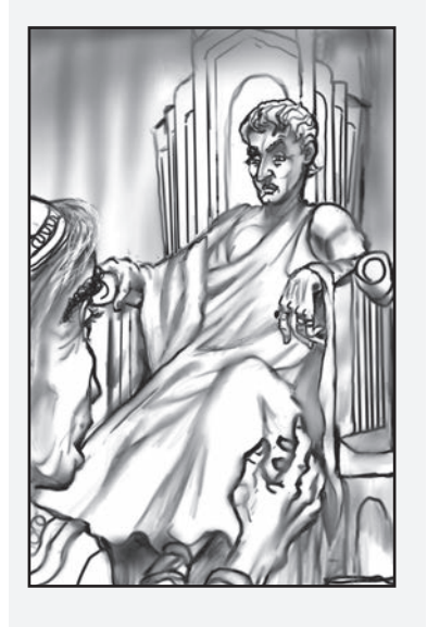
When the church allowed the government of Rome to solve its problems, things went from bad to worse.

In your own community, what are some of the things that could cause you to lose your faith or trust in God?